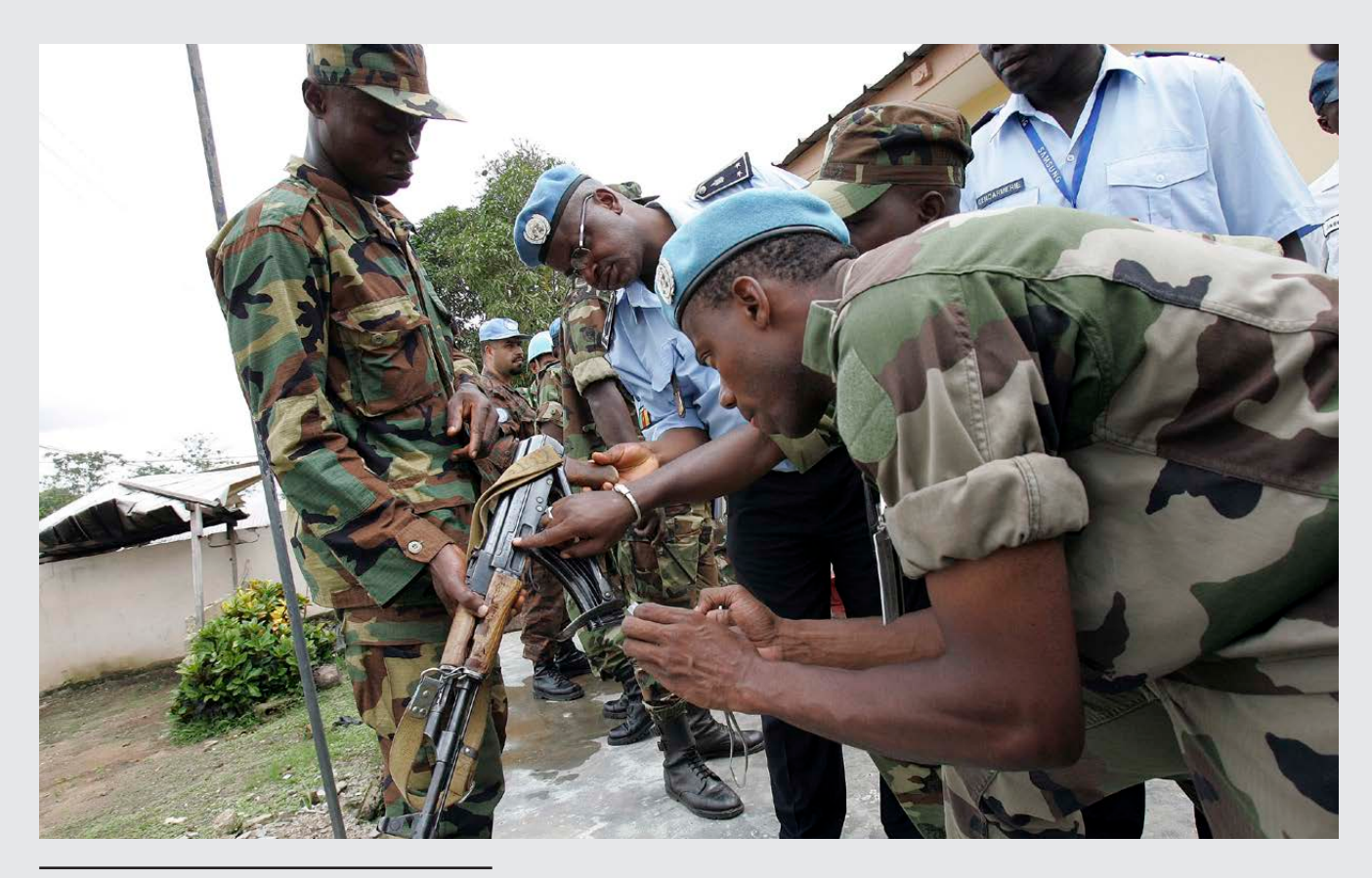
Peacekeepers conduct arms embargo inspections on Government forces in western Côte d'Ivoire, 2005.