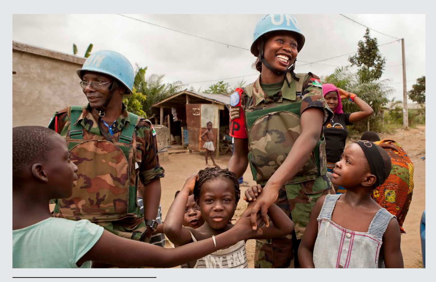
Malawian peacekeepers serving with the UN Operation in Côte d'Ivoire (UNOCI) greet children while on patrol, 2012.

sions to protect civilians under imminent threat of physical danger, prevent and respond to sexual violence, facilitate the delivery of humanitarian assistance, ensure security in and around IDP and refugee camps, and create conditions conducive to their voluntary and safe return. This resolution also reaffirmed the provisions of paragraphs 138 and 139 of the 2005 World Summit Outcome Document regarding the responsibility to protect populations from genocide, war crimes, ethnic cleansing and crimes against humanity. In his subsequent PoC Report, the Secretary-General welcomed resolution 1674 as an important step to reinforce the normative and operational framework.