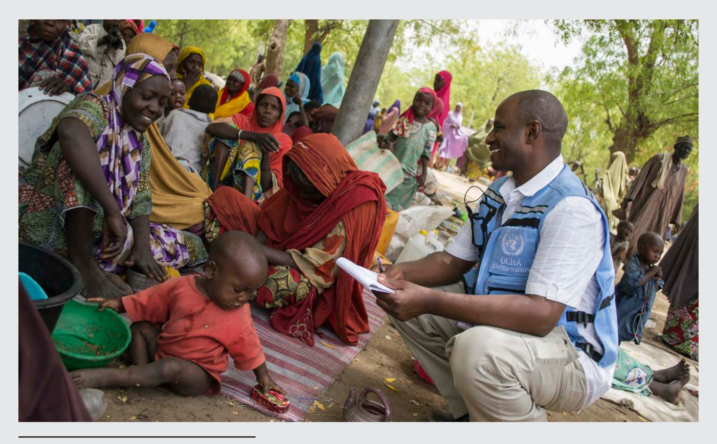
IDP camp, Bama town, Borno State, Nigeria, 2018.

has also emphasized the need to ensure and respect the civilian character and security of refugee and IDP camps or PoC sites and made reference to the Guiding Principles of Internal Displacement (the Guiding Principles) and the Kampala Convention. <sup>129</sup> To implement the protection of refugees and IDPs, the Council has increasingly included corresponding provisions in the mandates of UN peace operations. Peace operations have been mandated to ensure the civilian character or security of refugee and IDP camps or PoC sites or to proactively deploy to and conduct active patrolling in areas of high concentration of IDPs and refugees. <sup>130</sup> They have also been cautioned to pay particular attention to the