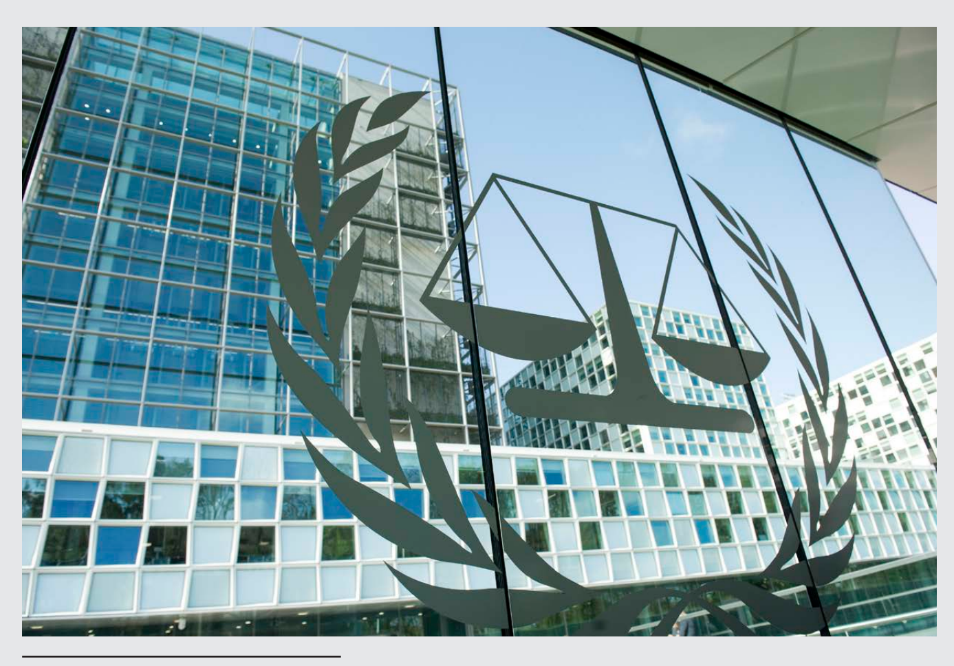
Permanent Premises of the International Criminal Court, 2016.

It has stressed the need to end impunity by bringing perpetrators to justice, emphasized the importance of prompt, transparent and comprehensive independent and/or impartial investigations, and recalled that violations of applicable international law may amount to war crimes.<sup>294</sup> It has focused significantly on the promotion of accountability through international mechanisms, highlighting the importance of strengthening international investigations and cross-border judicial cooperation in identifying and prosecuting perpetrators, welcoming the establishment of international commissions of inquiry, and promoting cooperation