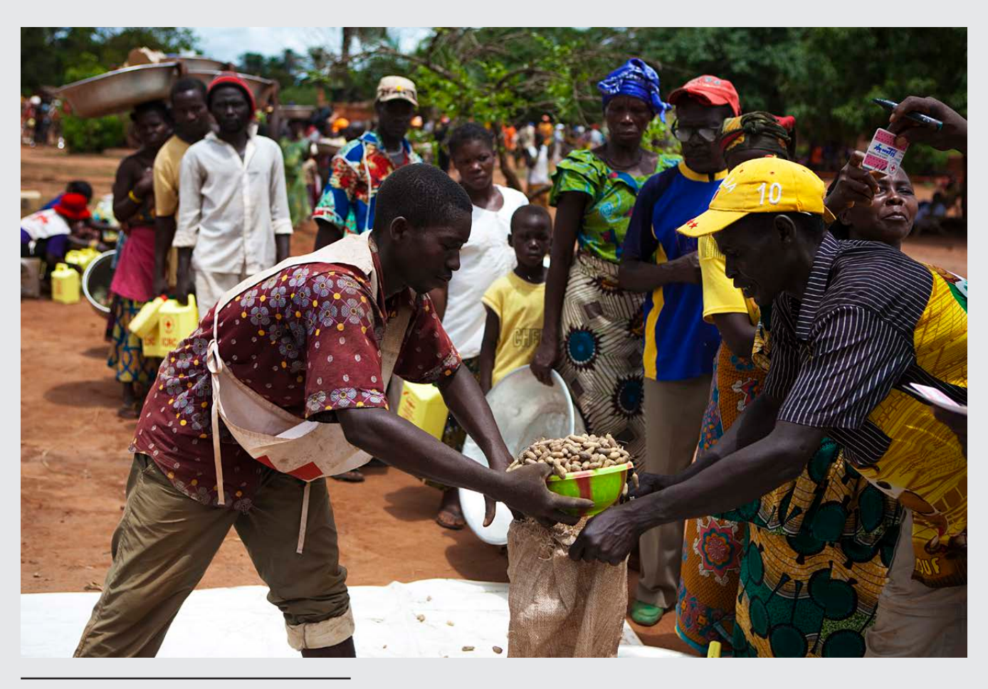
Humanitarian aid delivery in Haut Mbomou province, town of Obo, Central African Republic, 2010.

tack on the UN headquarters in Baghdad in 2003 and to a period marked by particularly high casualties among humanitarian workers in 2014 by adopting two dedicated thematic resolutions on the protection of UN and humanitarian personnel. ^{80}