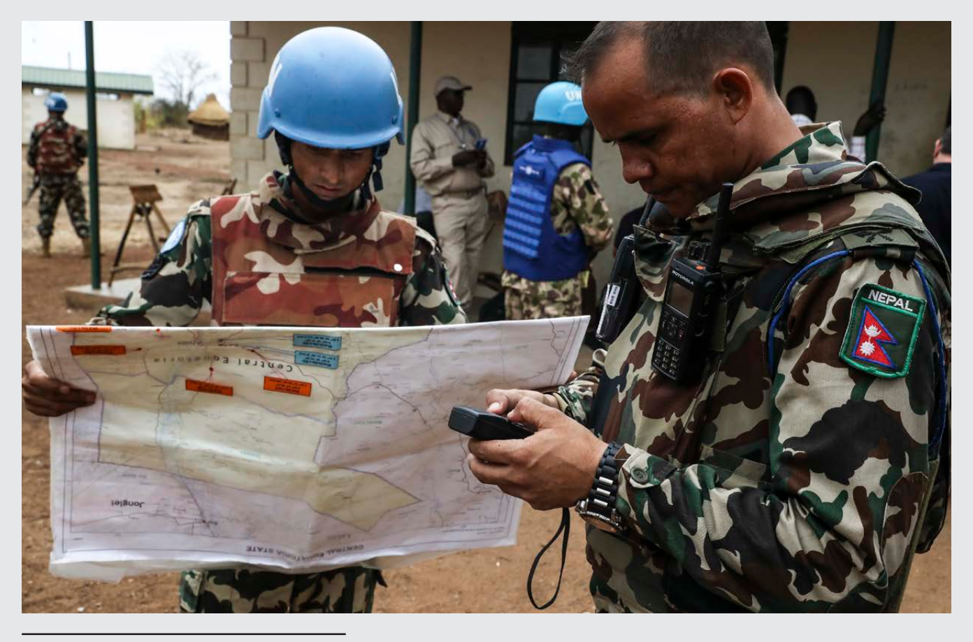
South Sudan integrated team visits site of recent attack on aid workers, 2017.

ing to Secretariat policy, public reporting on human rights, with several missions mandated expressly by the Council to monitor and report on threats to civilians and/or violations of IHL or human rights violations and abuses.<sup>280</sup> Four UN peacekeeping op-