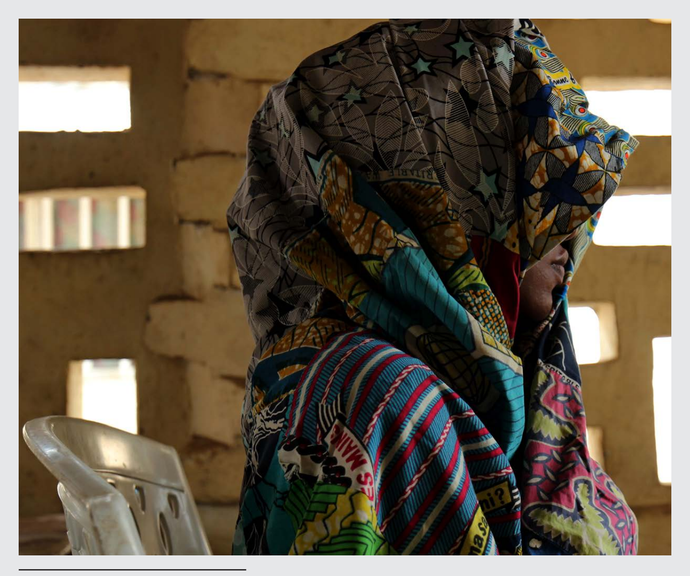
Hundreds of women have been raped in Kasai, a central DRC region struck by violence since August 2016.

GBV sub-cluster, gender theme groups, and the GBV Information Management System (GBV-IMS).<sup>165</sup> It is informed by UN entities, relevant institutional bodies, NGOs and civil society or-