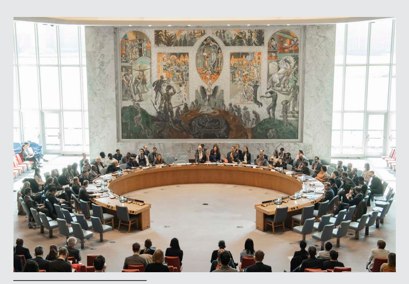
In a rare occurrence, the curtains of the UN Security Council were opened in April 2019 under a German Council presidency, to symbolize transparency and openness to the broader UN membership and civil society.

persons, women and children; providing protection through UN peace operations; and responding to violations through targeted measures and the promotion of accountability. In the 20 years since resolution 1265, the Council's work has centred around strengthening the PoC architecture through the adoption of thematic resolutions, the integration of protection concerns in country- and context-specific resolutions and actions, and the development of tools which seek to ensure the effective protection of civilians on the ground.