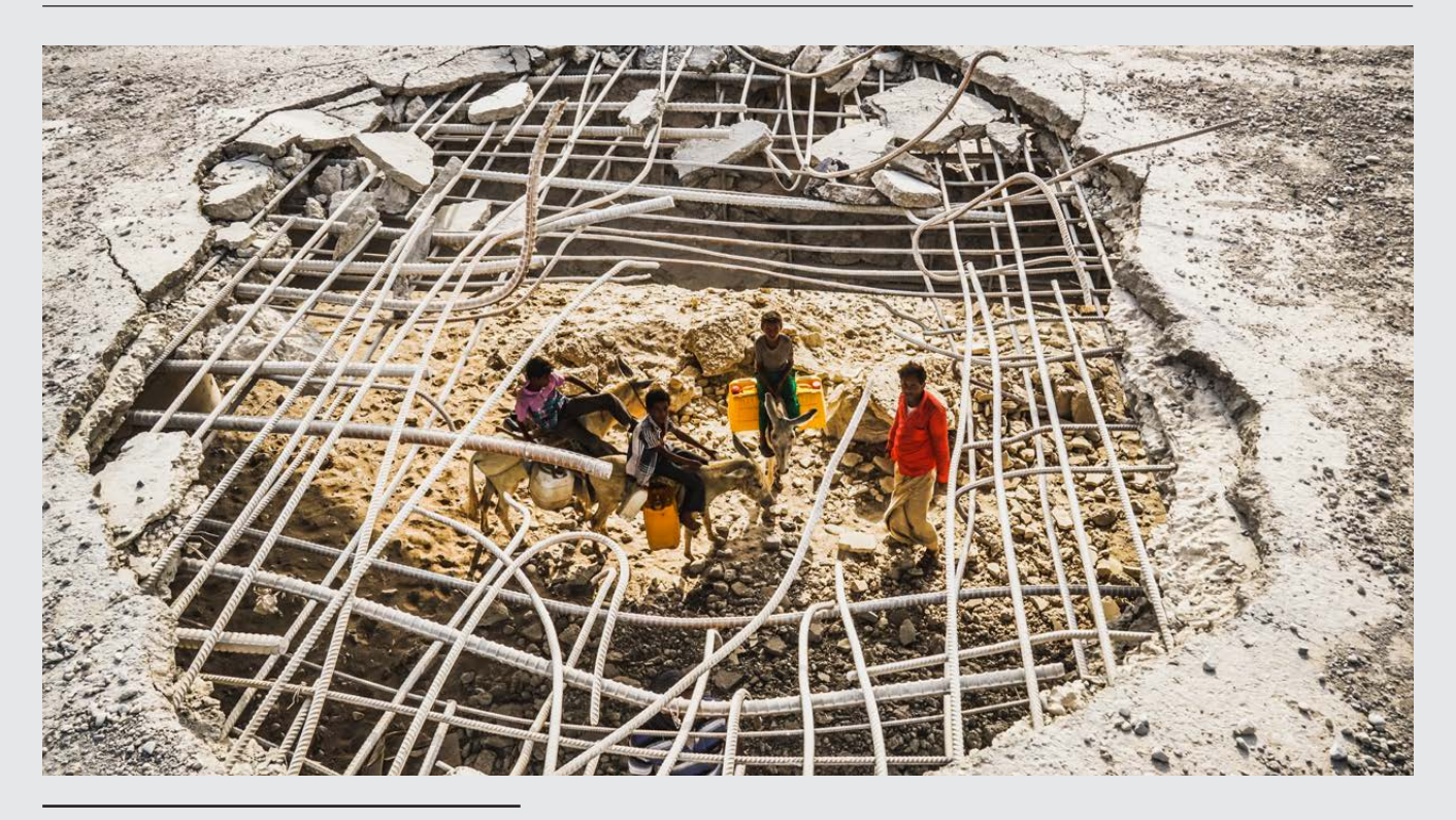
Al Hudaydah, Hajjah Road Bridge, Yemen, 2017. A man and his sons travel to collect water underneath a bridge that was hit by an airstrike in 2016.

Over the past two decades, a number of key themes have emerged in the Council's work on PoC, which have coincided to some degree with the themes and priorities identified in the Secretary-General's PoC Reports. They include (A.) enhancing respect for international law in the conduct of hostilities, (B.) facilitating access to humanitarian assistance and medical care, (C.) preventing and responding to forced displacement, (D.) according special protection to children affected by armed conflict and (E.) protecting women and combatting conflict-related sexual violence (CRSV).